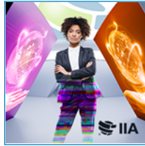
2024 GAM Conference March 11 - March 13 2024