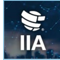
2024 Fraud Virtual Conference February 29, 2024