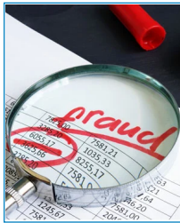
Risk, Fraud, and Illegal Acts