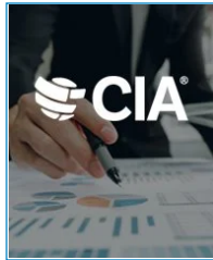
CIA Challenge Exam Preparation