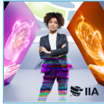
2024 GAM Conference March 11 - March 13 2024