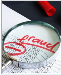
Risk, Fraud, and Illegal Acts