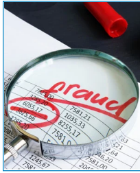
Risk, Fraud, and Illegal Acts