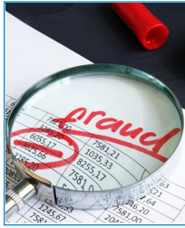
Risk, Fraud, and Illegal Acts