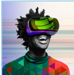
2023 Global Student Conference April 16, 2023 through April 18, 2023