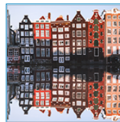
2023 International Conference July 10, 2023, through July 12, 2023