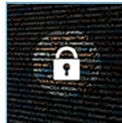
2023 Fraud Virtual Conference February 23, 2022