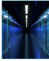
IT Essentials - Assessing Networks and Infrastructure