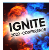
2022 Ignite Conference | October 31, 2022 through November 2, 2022