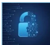
2022 Cybersecurity Conference | October 27, 2022