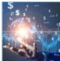
2022 Financial Services Exchange | Sept 19 - 20, 2022