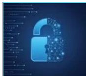
2022 Cybersecurity Conference | October 27, 2022