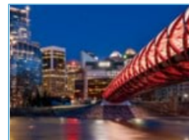
Canada National Conference | October 16-19, 2022