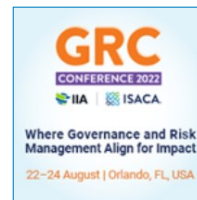
2022 GRC Conference | August 22 - 24, 2022