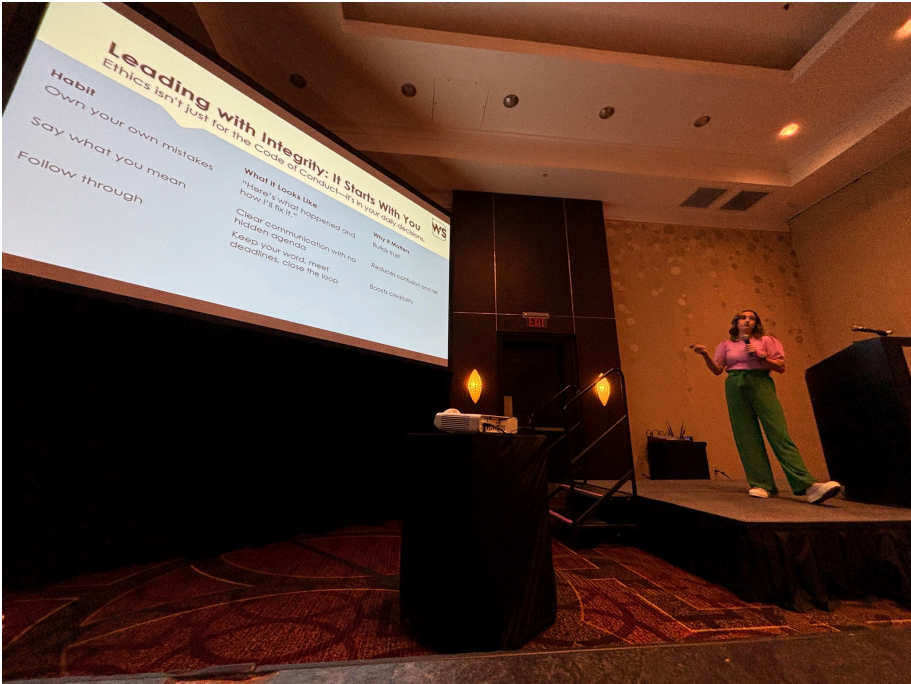
Fall Conference with LSUCIA&CRM

The chapter celebrated 51 years of growth, learning, and community building throughout 2025-2026.