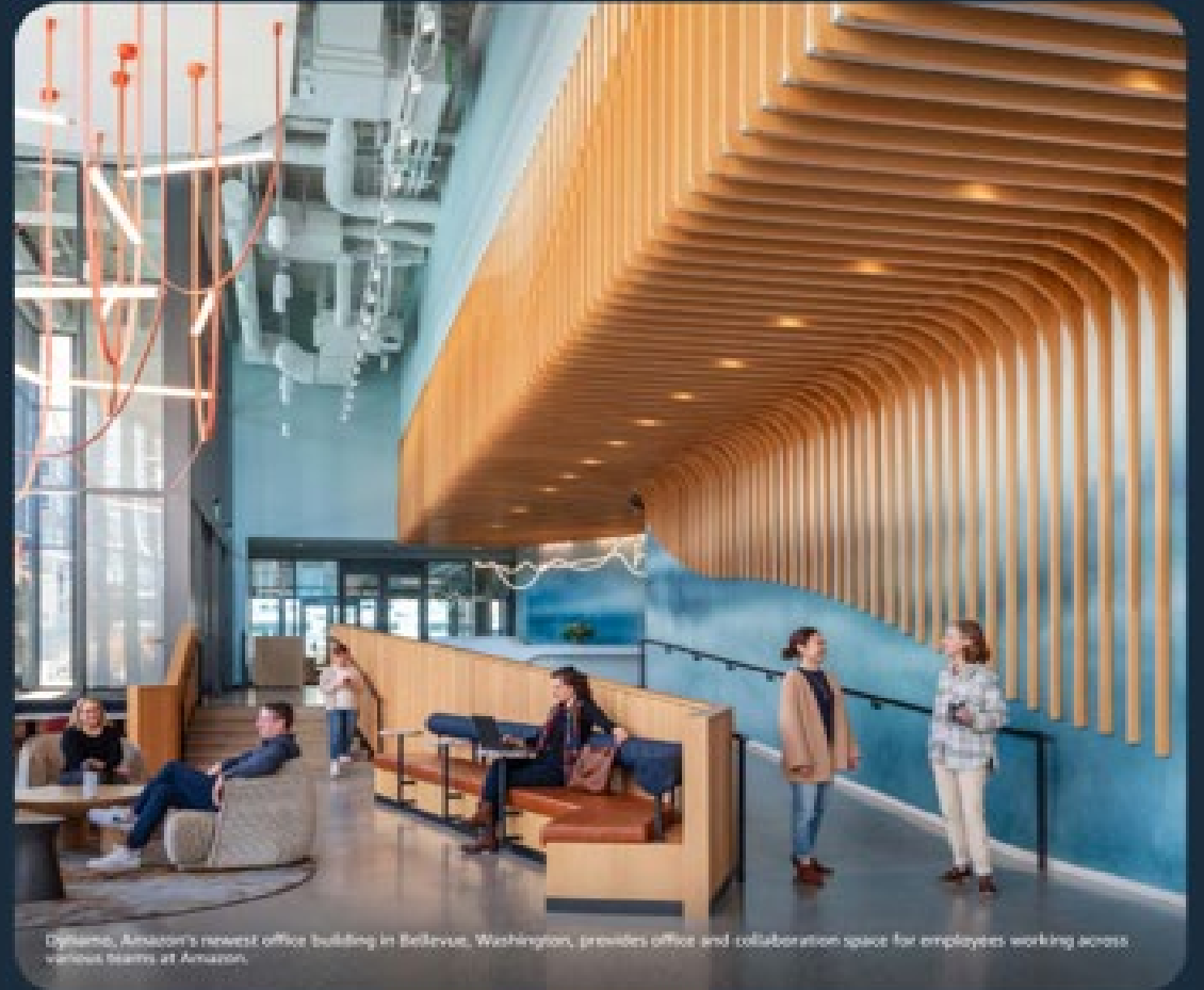
Dynamo, Amazon's newest office building in Bellevue, Washington, provides office and collaboration space for employees working across various teams at Amazon.