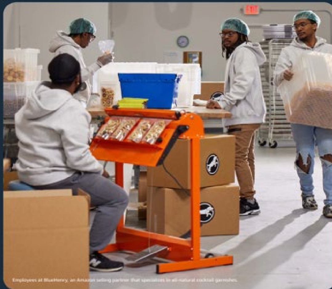
Employees at Blueberry, an Amazon selling partner that specializes in all-natural roasted granolas.