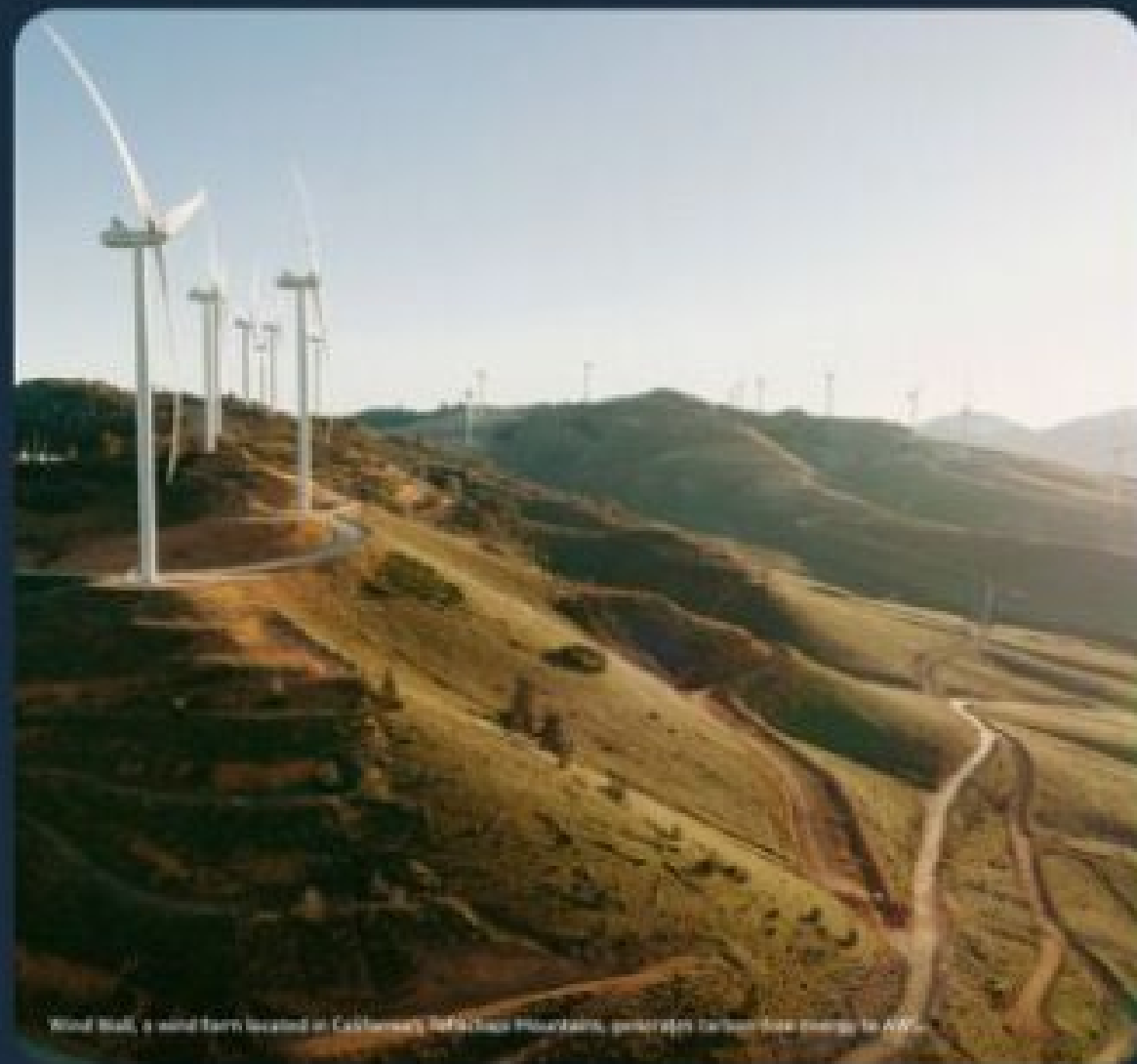
Wind Wall, a wind farm located in California's Tehachan Mountains, generates carbon-free energy for AWS.