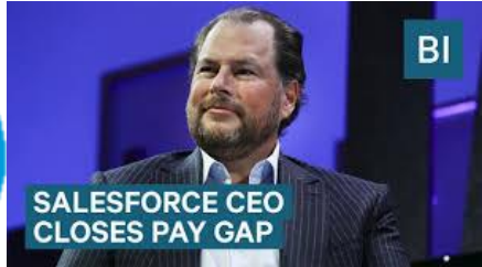
CEO – Mark Benioff